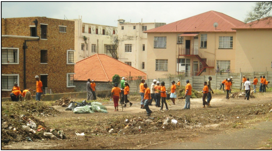
ANC Youth League members clean up vacant plots in Pope St